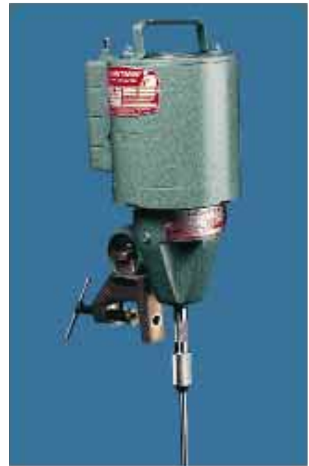
Model S1U10 and Model S1U05T